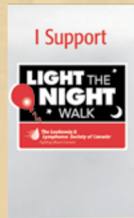
Light The Night Decal