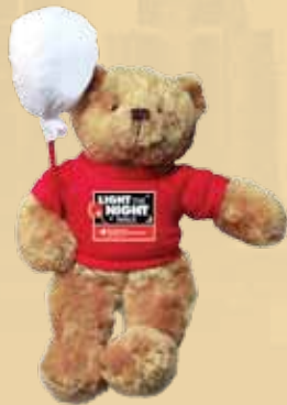
Light The Night Bear

Contact your Light The Night staff to get all the details!