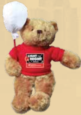
Light The Night Bear

Contact your Light The Night staff to get all the details!