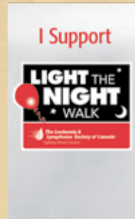
Light The Night Decal